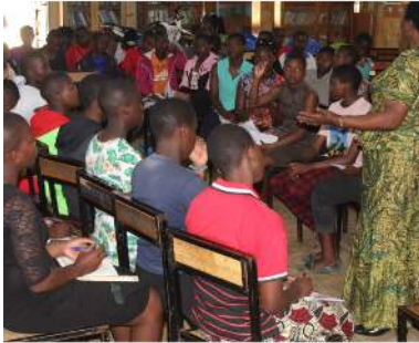
Career guidance & counselling