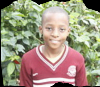
AJS Best Student