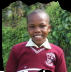
MJS Best Students