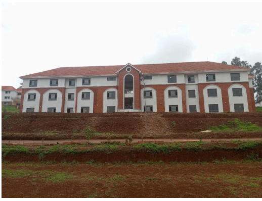
Schoenbrun Science and ICT Building