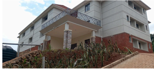
Amy Juliet Angel Girls' Dormitory