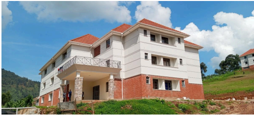
Gupta Family Foundation Boys' Dormitory