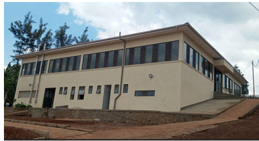
Tennenbaum Dining Hall

REACH and AAH Leadership Meet with Uganda's Speaker of Parliament.